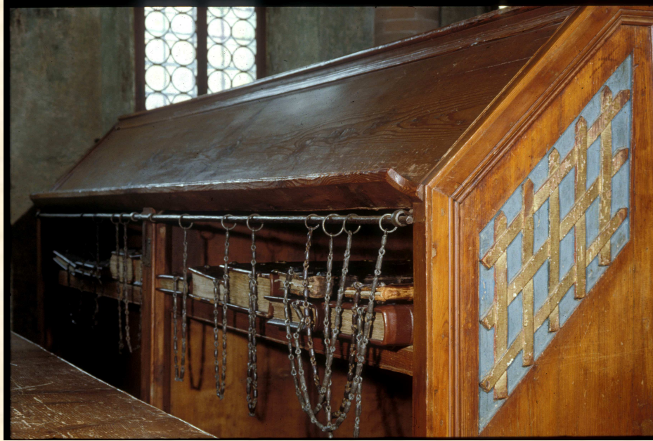
Pluteo with chains